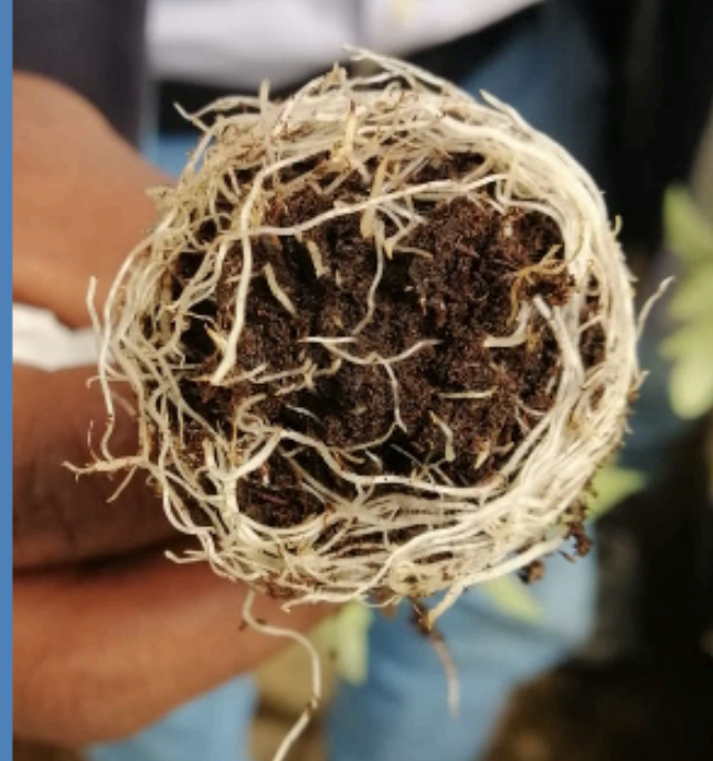
ماء حيوي بجهاز EWO WATER