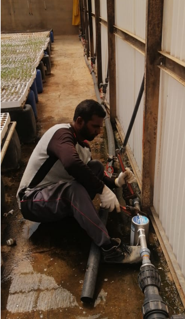
Installation of EWO® CLASSIC