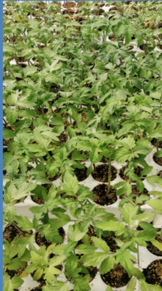
ماء حيوي بجهاز EWO