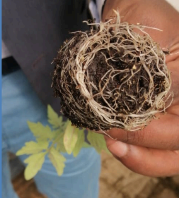
ماء عادي NORMAL WATER